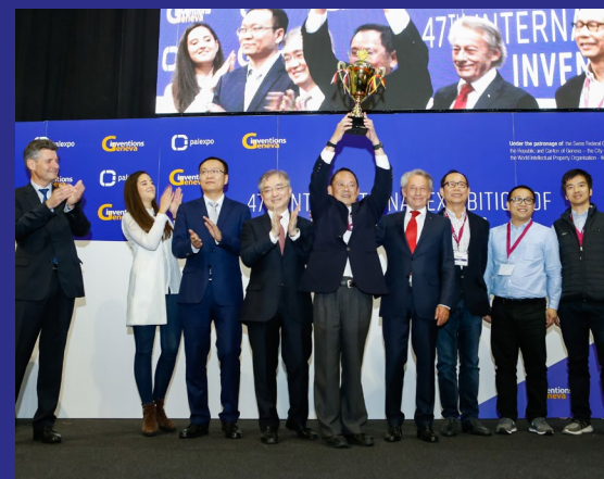
Grand Prix 2019 - for GRST Holdings Limited from Hong Kong for the first recyclable car battery.