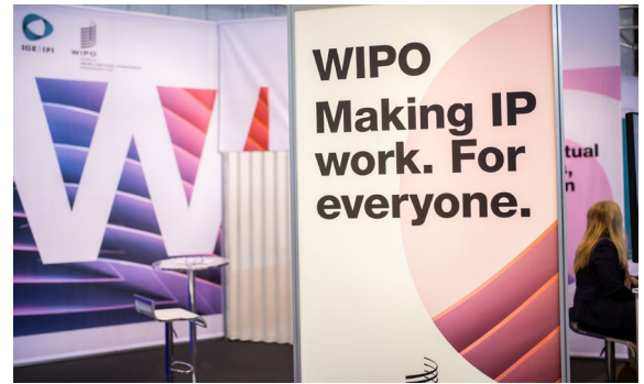
Stand of WIPO (World Intellectual Property Organisation) and IPI (Swiss Federal Institute of Intellectual Property)

The International Exhibition of Inventions of Geneva benefits from the most extensive support and privileges that can be granted to an exhibition. It is under the patronage of the Swiss Federal Government, the State, the City of Geneva and of the World Intellectual Property Organization - WIPO.