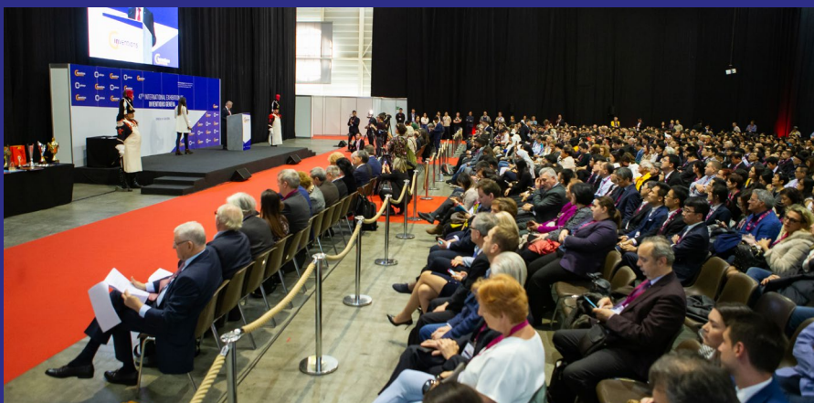
More than 1'000 exhibitors, personalities and journalists participate at the prize-giving ceremony